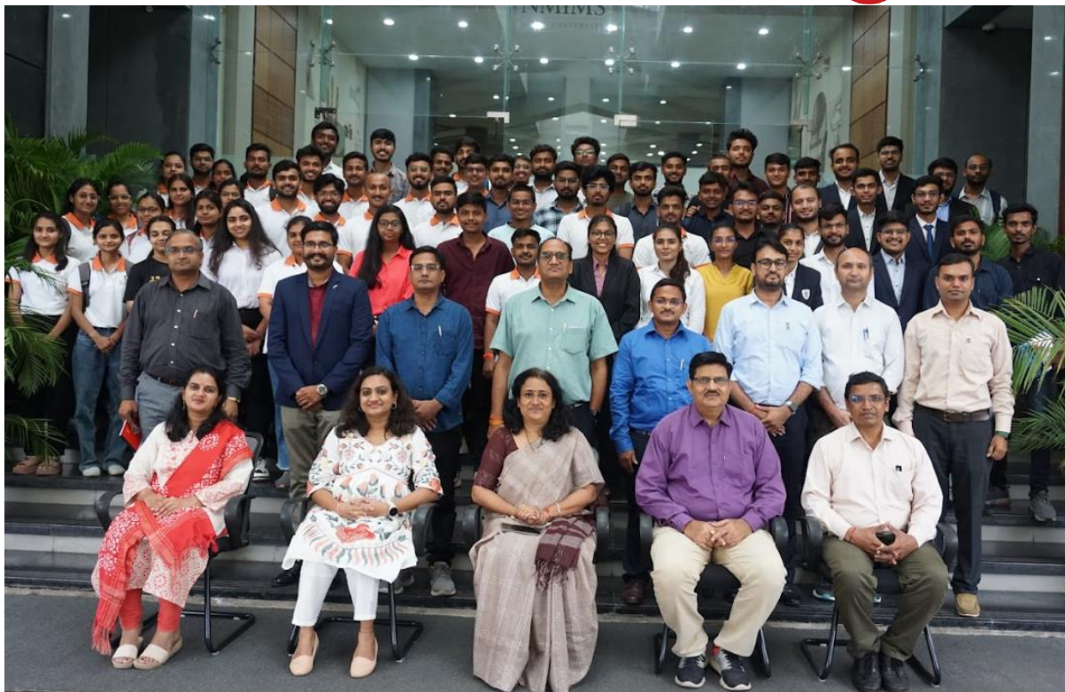
Group Photo Session with Participants (Day-I)