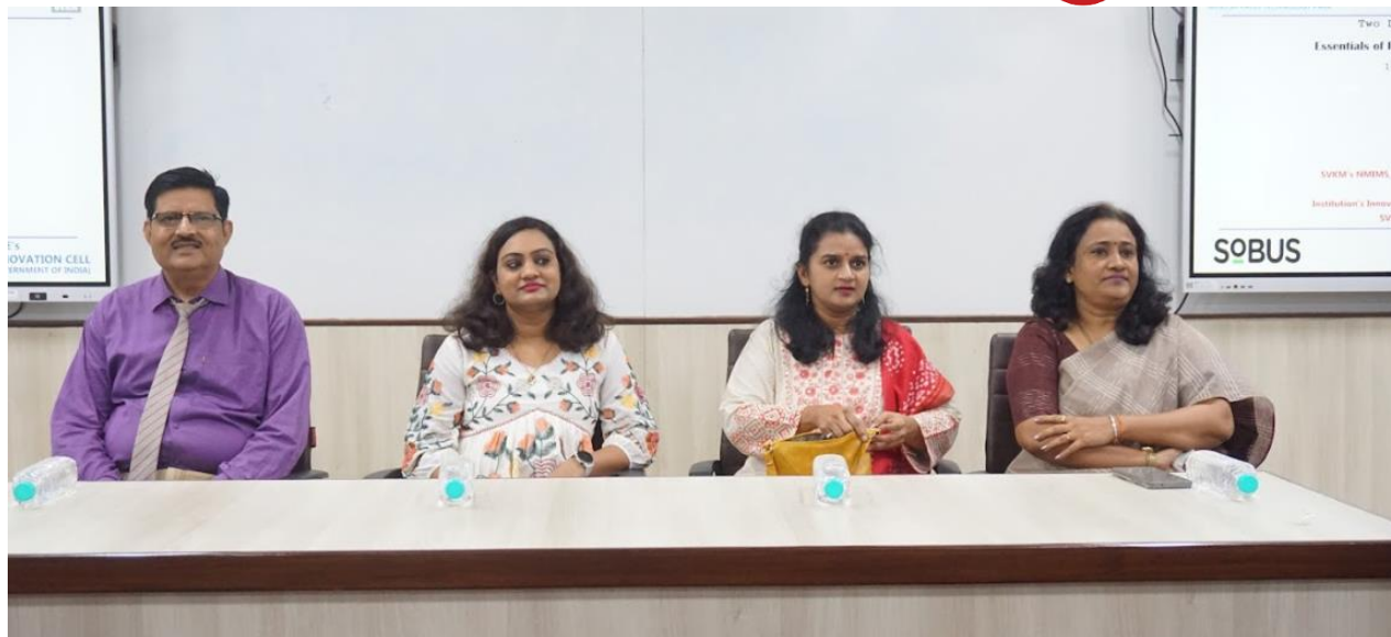
Dignitaries along with the session speakers