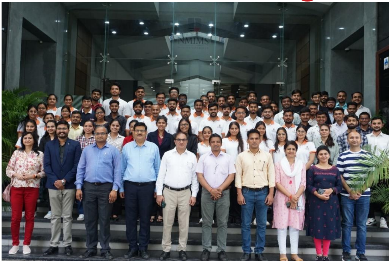
Group Photo Session with Participants (Day-II)